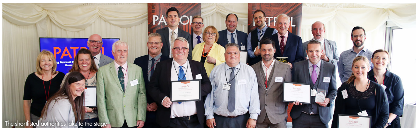
The shortlisted authorities take to the stage

The Best Overall Report award is judged on the effectiveness of presentation, and how engaging, informative and helpful it is to the local community.